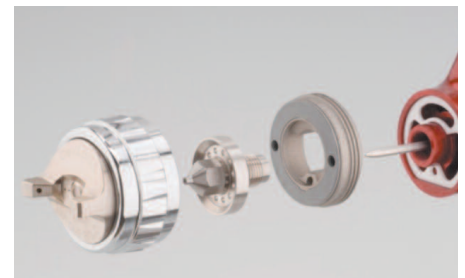
JGA HD Pressure Fluid Tip/Needle (mm) size and code: 0.85, 1.0, 1.2, 1.4, 1.6, 1.8 JGA HD Suction Fluid Tip/Needle (mm) size and code: 1.6, 1.8 GFG HD Gravity Fluid Tip/ Needle (mm) size and code: 1.4, 1.6, 1.8