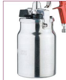
Suction cup pt. no. TGC-545-E-K

JGA and GFG HD spray guns are packaged as pressure gun only, suction gun kit includes 1 litre cup and gravity kits include the 568 ml standard gravity cup.