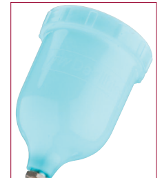
Gravity cup (Blue polyester) pt. no. GFC 511 for difficult fluids.