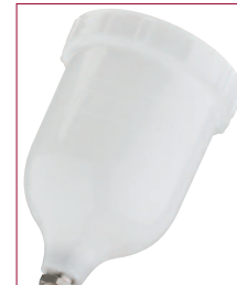
Gravity cup pt. no. GFC 501